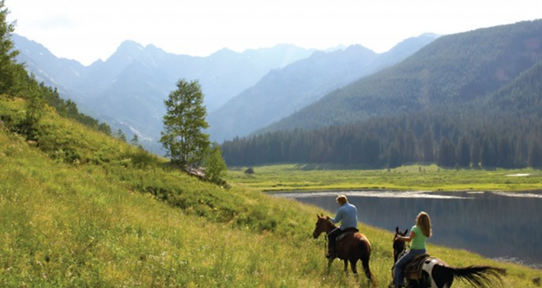
Vail Village is the gateway to a system of trails for summer and winter mountain pursuits.