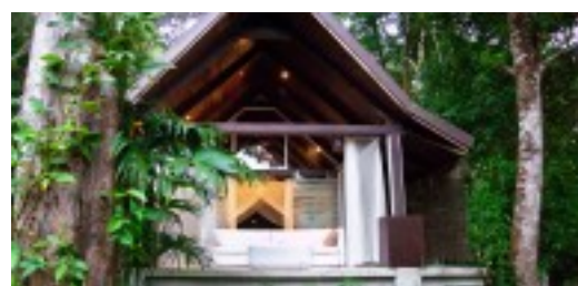
Oxygen Jungle Villas Visit Sale