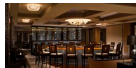
Forty 1 North — Newport, RI Visit Sale