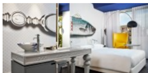
Andaz Amsterdam Prinsengracht