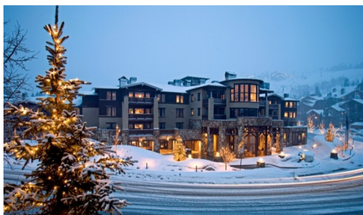
Chateaux at Deer Valley is just 150 yards from the closest Deer Valley lift.

After a day on the hill, schussers can slide into the spa — upgraded just last season — where a European-influenced treatment menu maximizes the marine-based Phytomer product line. After repairing your body, refuel for tomorrow's pow runs at Cena Ristorante, which serves fortifying portions of Italian dishes (antipasti, flatbread pizzas, homemade pastas) and pours brews by local faves like Squatters and Wasatch.