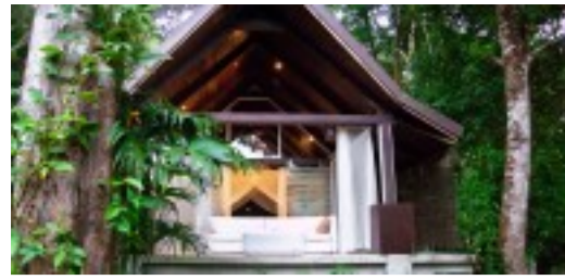
Oxygen Jungle Villas Visit Sale