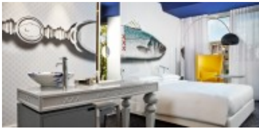
Andaz Amsterdam Prinsengracht Visit Sale