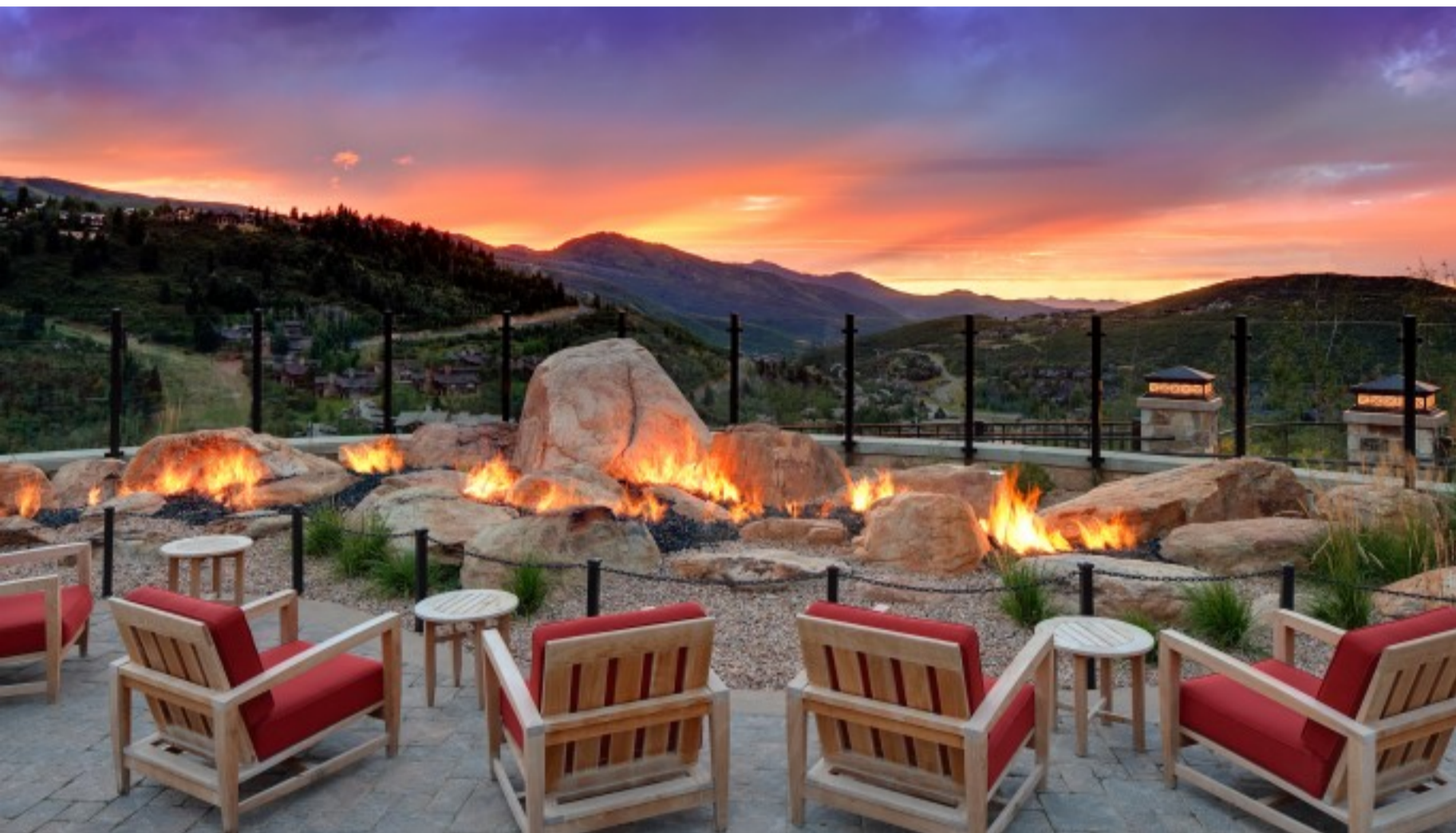
Enjoy the sunset on the Mountain Terrace and stay warm by the fire garden.