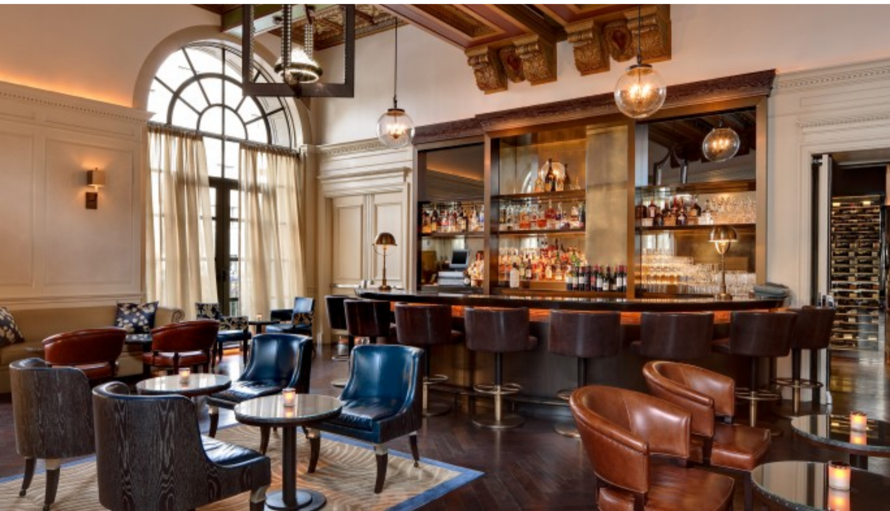
An impressive, worldly wine menu offers some serious international nightcaps.