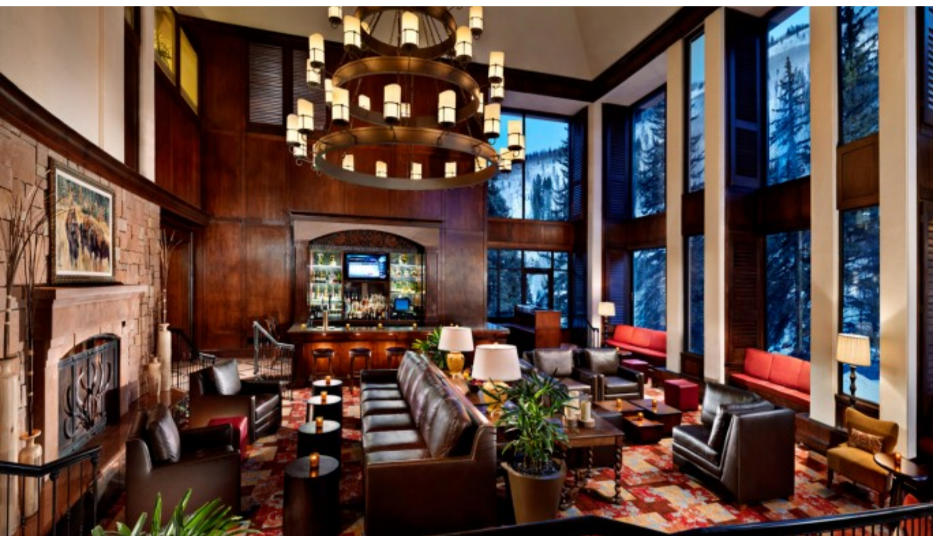
Fireside Lounge is a popular après-ski spot that puts its own spin on traditional bar fare.