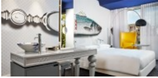
Andaz Amsterdam Prinsengracht Visit Sale