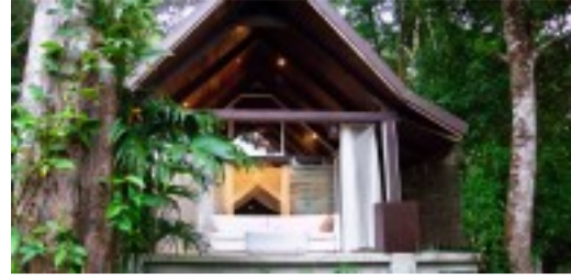
Oxygen Jungle Villas Visit Sale