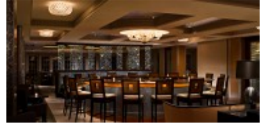
Forty 1 North — Newport, RI Visit Sale